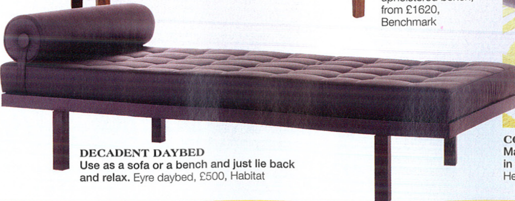
DECADENT DAYBED Use as a sofa or a bench and just lie back and relax. Eyre daybed, £500, Habitat