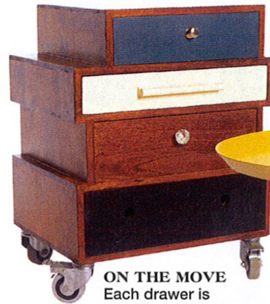
ON THE MOVE Each drawer is unique on this wheelie unit. Mixed up side table, £425, Rose and Grey

TOP Add a colour to a bright table. yellow, £139, Lollipop