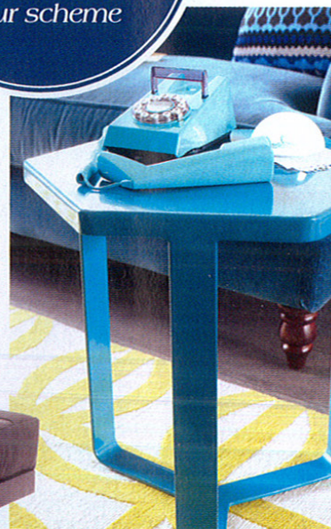
COLOUR BLOCK Made from powder-coated steel and in turquoise, pink, purple, black and... Hexagonal table, £210, Emma Deacon

WORDS AND STYLING: CHARLOTTE BOYD AND ALAINA BINKS.