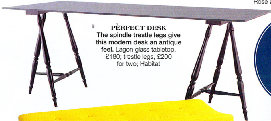
PERFECT DESK The spindle trestle legs give this modern desk an antique feel. Lagon glass tabletop, £180; trestle legs, £200 for two; Habitat

TOP Add a colour to a bright table. yellow, £139, Lollipop